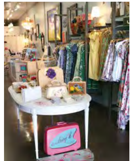
» Today's Magnolia Park is appealingly eclectic. The New Deal, top, offers tasty takes on classic dishes. Plush Puffs, above, handcrafts its marshmallows. Audrey *K Boutique & Gifts, right, has new yet retro-inspired designs.

CLOCKWISE FROM TOP: VISIT BURBANK; AUDREY *K BOUTIQUE & GIFTS; VISIT BURBANK; PLUSH PUFFS