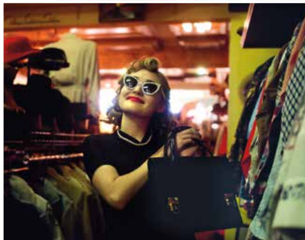
» The Magnolia Park district in Burbank, California, proudly displays the retro fashions of yesteryear in shops such as the vintage boutique Playclothes (above and left).

Hollywood, Burbank seems to suffer no FOMO. Instead, the city embraces its retro and offbeat character, especially here in the Magnolia Park district. Burbank could sport a swagger, as a city with one of the highest concentrations of studios and production facilities in the world. Instead, it lets its star-dusted neighbor bask in the limelight, even though Burbank is where a great deal of movie magic happens.